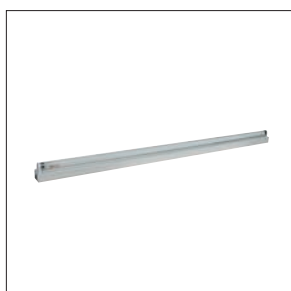
Lampa fluorescenta FIA EUR 24.00 cu instalatie electrica completa 1x40W Cod 019.010.110.000