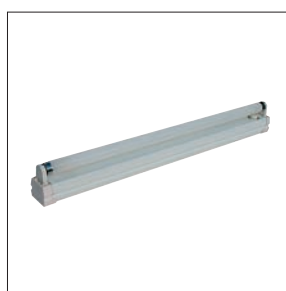
Corp fluorescent tip SS30 EUR 27.00 cu un tub D-170 - A Cod 019.010.190.001