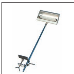
Reflector cu brat 300W EUR 50.00 Cod 019.010.200.010