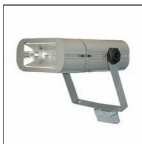
Reflector IVEN HQI 150W EUR 50.00 Cod 019.010.200.005