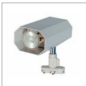
Spot halogen SY STAR 50W(A) EUR 24.00 Cod 019.010.186.000