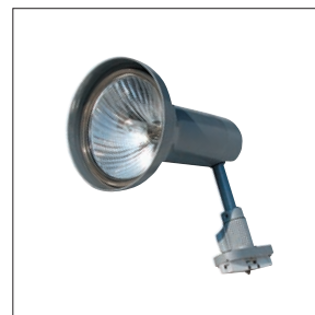
Spot halogen 100W EUR 24.00 SY STAR Cod 019.010.185.000