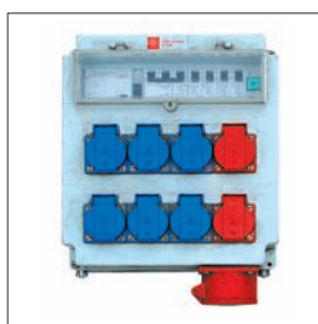
Panou Electric OCTANORM EUR 210.00 Cod 019.010.275.000