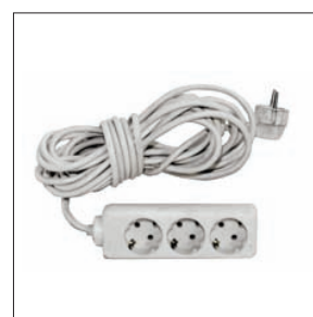
Prelungitor 230V, 10A, 5m EUR 18.00 Cod 019.010.279.000