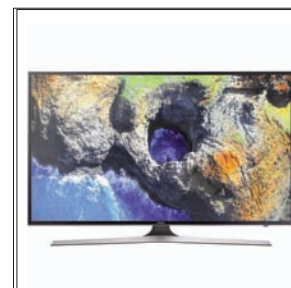
TV SAMSUNG UHD EUR 85.00/zi (diagonal screen: 163 cm) Code 025 010 130 047