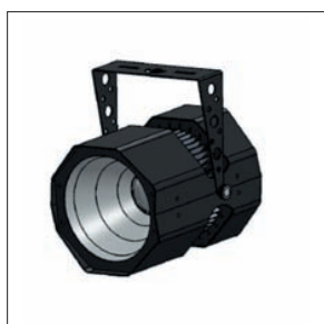
Reflector LED VIRGO EUR 55.00 40W 4350 LM 4100 K Cod 019.010.200.045