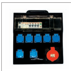
Panou Electric 380V/220V EUR 210.00 Cod 019.010.265.000