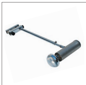
Lampa spot cu brat 100W EUR 21.00 Cod 019.010.181.000