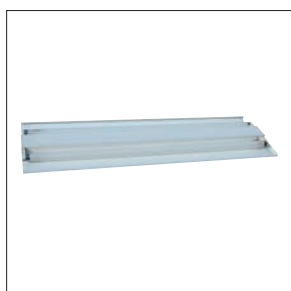
Corp fluorescent tip OCTANORM EUR 29.00 cu doua tuburi D-171 Cod 019.010.200.000