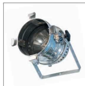
Reflector PAR64 500-1000W EUR 55.00 Cod 019.010.200.020