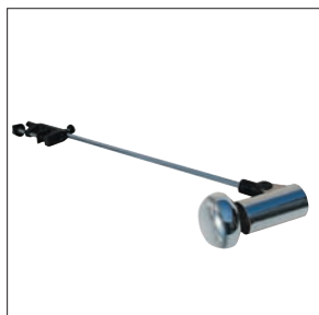
Lampa spot cu brat EUR 21.00 Cod 019.010.180.000