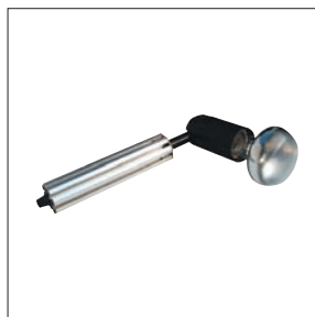
Lampa spot stut OCTANORM EUR 21.00 Cod 019.010.187.000