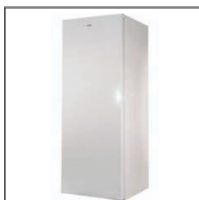
Frigider ARCTIC 255 I EUR 80.00 Cod 025 010 020 199