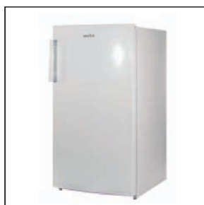
Frigider ARCTIC FB 155 EUR 36.00 Cod 025 010 020 198